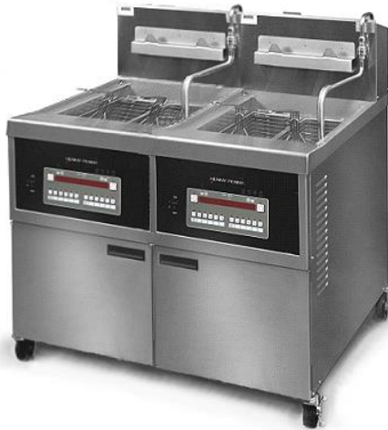
OFG 342 2-well large capacity gas open fryer with Computron™ 8000 control

Henny Penny open fryers offer high-volume frying with programmable operation, oil management functions and fast, easy filtration.