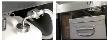
Oil replenished automatically from JIB for multi-well (left) or reservoir for 1-well (right)

Henny Penny Evolution Elite® open fryers use innovative filtering and oil level technology to extend oil life, improve product quality and reduce overall oil consumption and costs. Here's how: