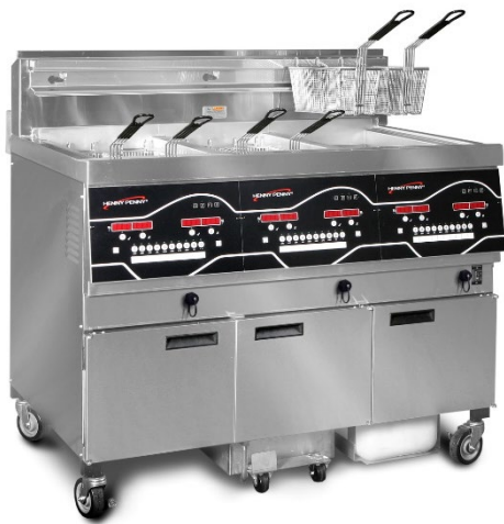
EEG 243 3-well gas open fryer