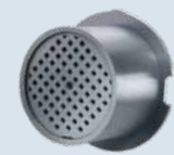
Activated Charcoal Filter Part no.: 3988129100

° = Measurements taken at +25°C ambient and +12°C interior temperature tested by Liebherr Germany (not to Australian standards).